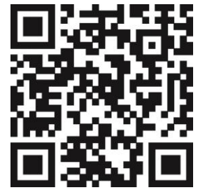
Parish Website QR Code

Our churches have an induction loop. Hearing aid users should use the T setting