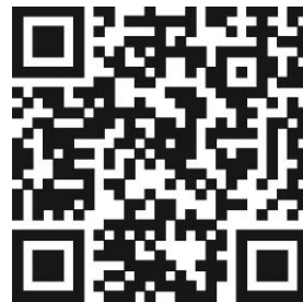
Parish Website QR Code

8.45am St Michaels Church open for personal prayer.